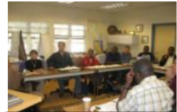
Improve adult learning by having clear learning objectives.

Copyright © UC Regents Davis campus, 2013. All Rights Reserved.